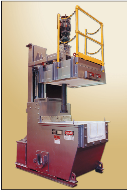
SNIF SHEER P-30HB System in maintenance position.

The SNIF® SHEER P-30 Single Nozzle System provides a nominal continuous refining rate of 30,000 lb (14,000 kg) per hour. The system consists of a heated refining furnace, one (1) SNIF SHEER spinning nozzle, and PLC automated process and furnace heating controls.